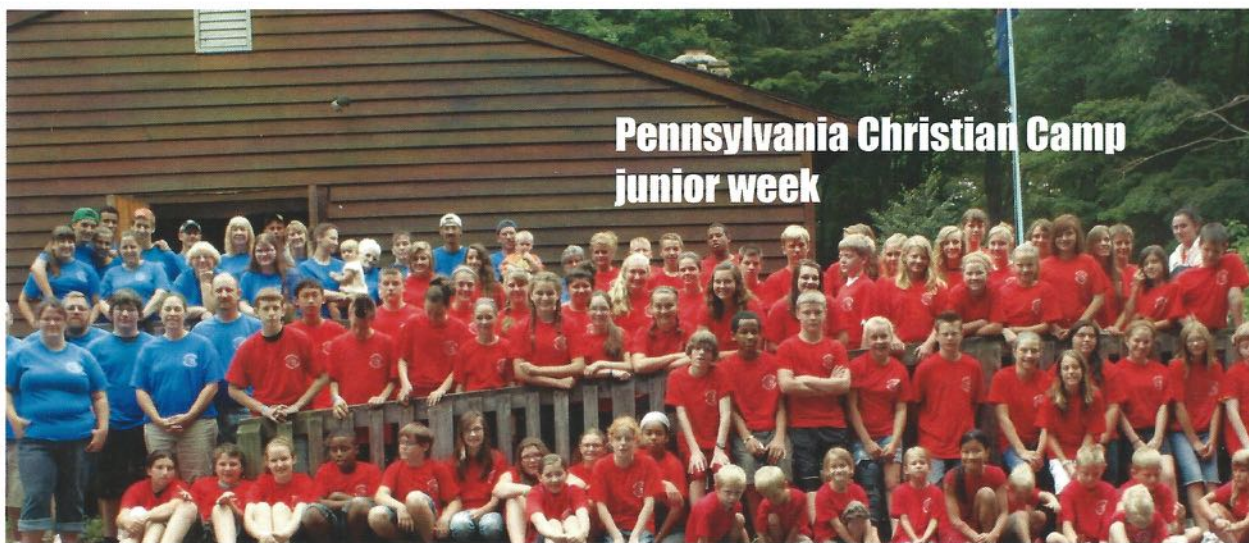
Pennsylvania Christian Camp junior week