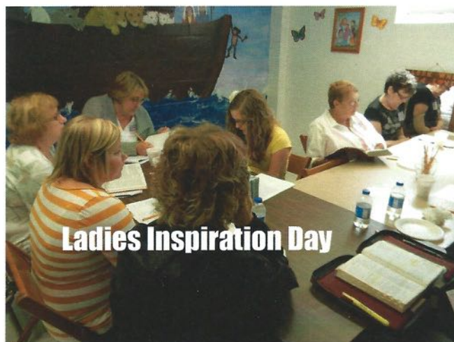
Ladies Inspiration Day